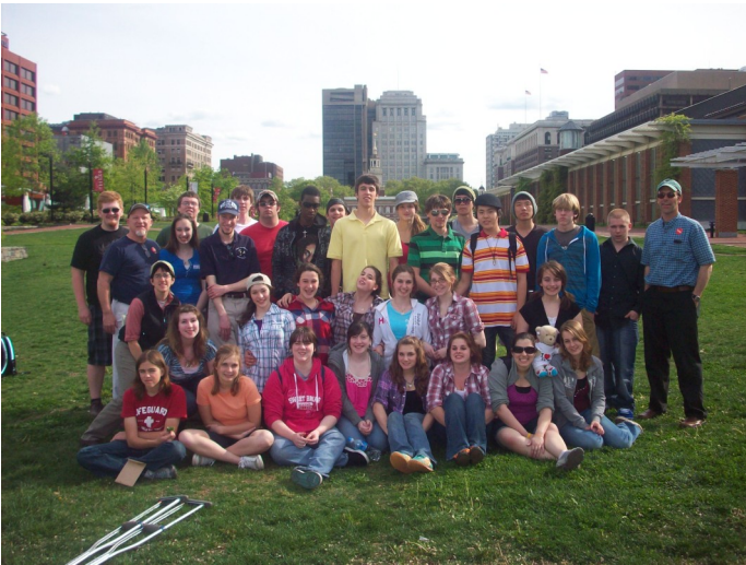
Group photo from Spring 2010 Mission Trip to Philadelphia

Jesse Remington High School is a Christian community of students and faculty, pursuing wisdom, knowledge and understanding, and is committed to raising a generation to be effective leaders for Jesus Christ.