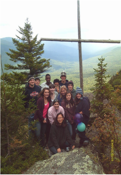
Seniors at Horton Center's Chapel Rock